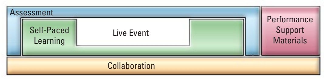
Figure 2: 5 Ingredients for Blended Learning