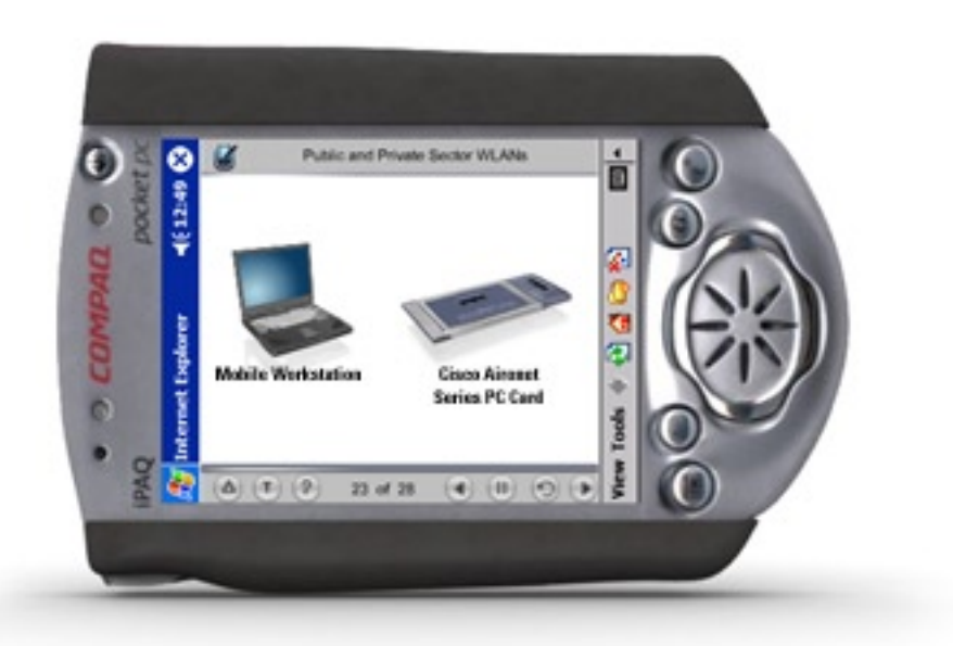
Figure 5: Multimedia Learning Objects on a PDA

With the increasing availability and popularity of personal digital assistants (PDAs), learners can now take multimedia learning objects with them wherever they go. Self-paced learning objects—complete with 3-D animations and MP3 audio—can be downloaded to learners' PDAs, taking the term "just-in-time" support to a new level.